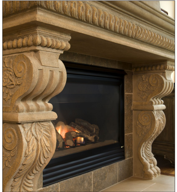
Perlite cultured stone and gas fireplace logs